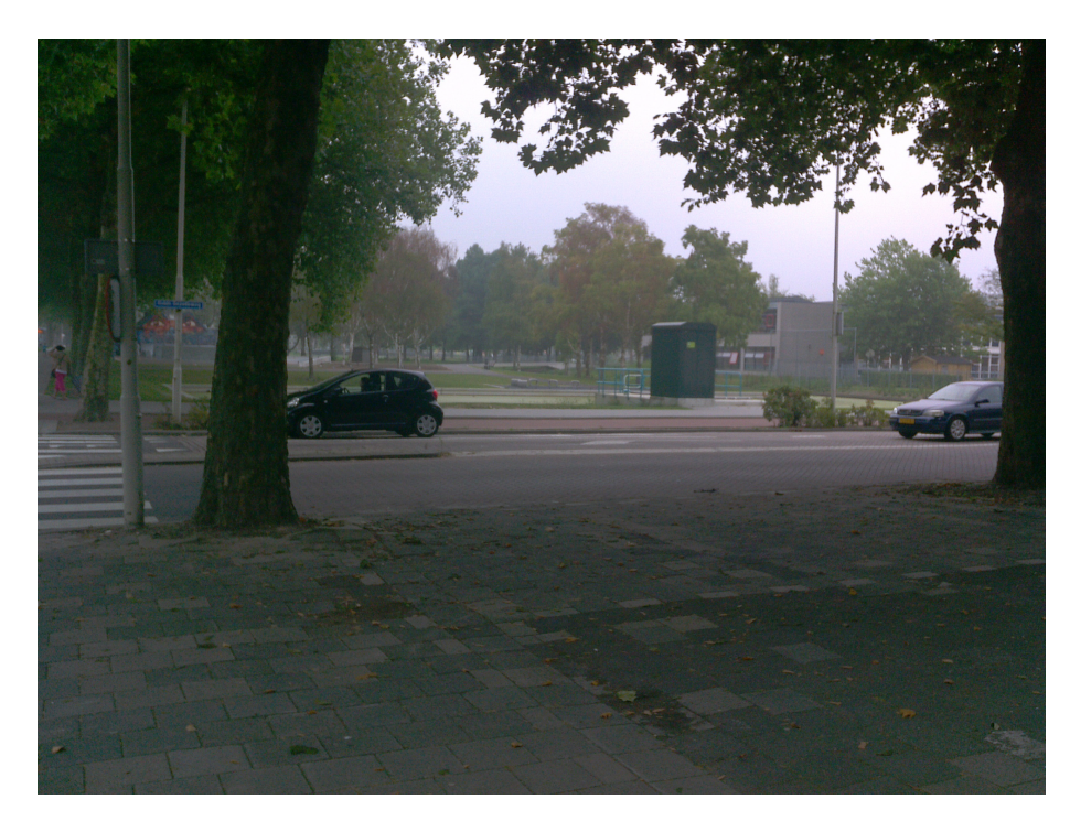
figure 2: The park is surrounded by roads