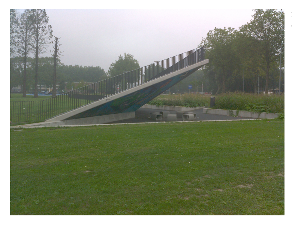
figure 3: some elements in the park (benches covered by a canopy)

figure 2: The park is surrounded by roads