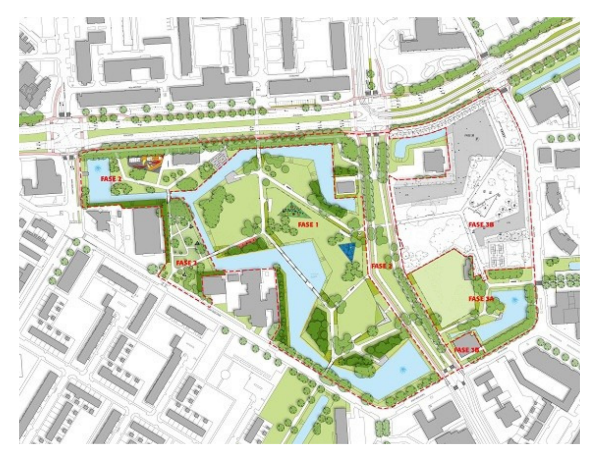
Figure 1: Spinoza park Rotterdam

The Spinoza park is situated in Rotterdam-south. The park is a rather small park (70 hectare) enclosed by busy roads (Guide Gezelleweg, Pascalweg, Catullusweg and the Spinozaweg). The park has been laid out in the sixties. The park is very open and easily accessible. It can be entered 24 hours a day and 7 days per week. The design of the park is quite modern and sleek. The Spinoza park encloses some schools, a small gymnasium some playgrounds and water courts. The gymnasium will be removed coming years. There are a few trees and the borders did not contain any flower during the observation. In the recent past it was concluded that the park did not attract many visitors. This was, together with the retarded maintenance the reason to start a re-construction. This re-construction will be finalised in November 2013. During the observations, the measurements and the survey with the questionnaire, the park was almost ready (except the flowers) and the removal of the gymnasium. That is why the municipality of Rotterdam, together with the districts' administration decided to regenerate this park. At this moment (November 2013) this park is still under (re-)construction.