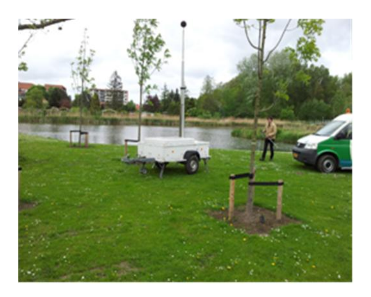
Figure 3: noise measurements in the Southern Park

The short term measurements were carried out during the interviews and the long term measurements were conducted over at least 4 weeks. During the measurements also sound recording were made in the Florence and Rotterdam pilot areas. A lot of data was collected because samples had been taken every second. This made that almost every parameter could be estimated, from L_1 to L_{\text{Aeq}(24 \text{ hr})} . This information delivered information on events, background noise, events, dynamics of the noise, et cetera. It appeared that the noise levels in the Rotterdam parks and the San Marina peri-urban park were rather low compared to the other pilot areas.