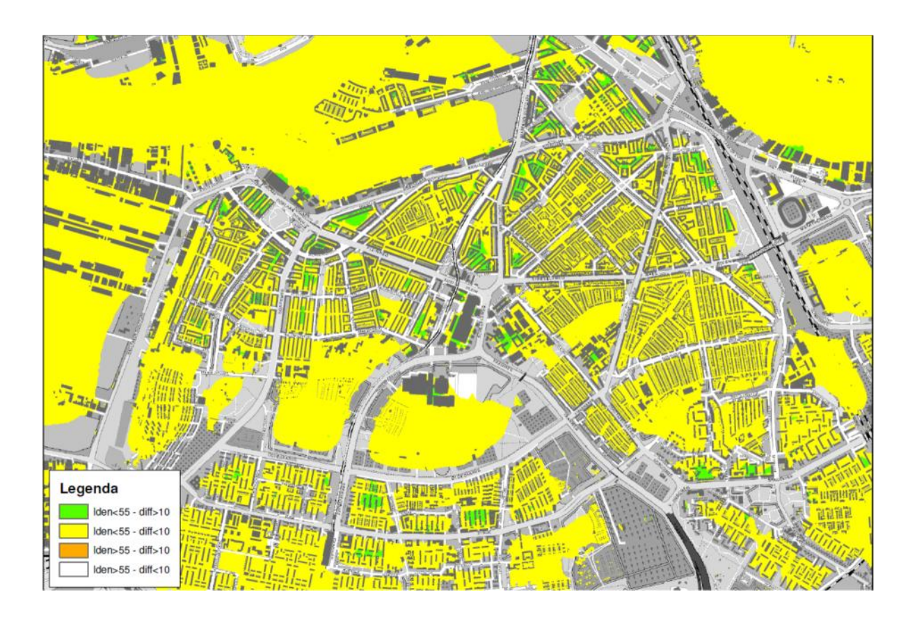
Figure 2: noise levels and noise gradients Rotterdam areas